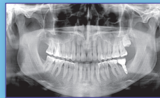
Exceptional image quality