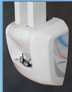
Futuristic design coupled with ergonomics