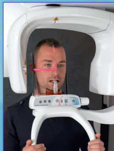
Ahead of its time