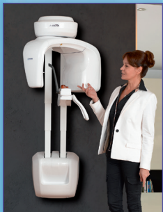
Perfection within your budget